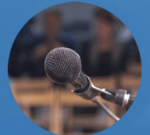
4-WAY TEST SPEECH CONTEST