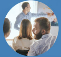
DISTRICT TRAINING ASSEMBLY