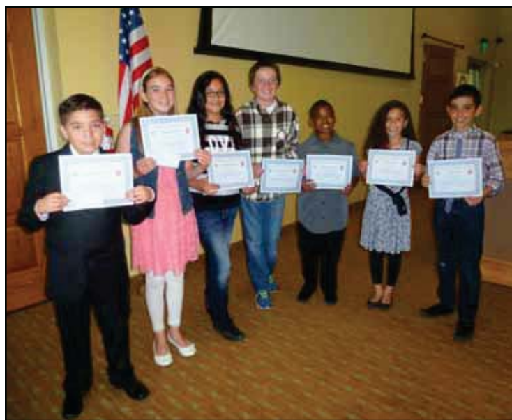
Congratulations to the 4-Way Test Speech Contestants!